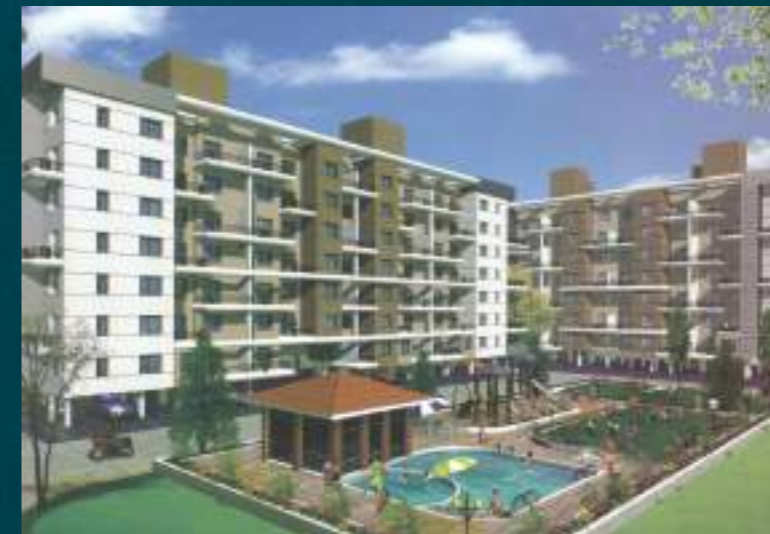
Treasure Island, Pimple Saudagar