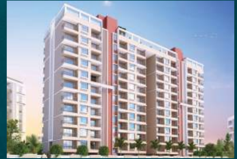
AR Imperia, Wakad