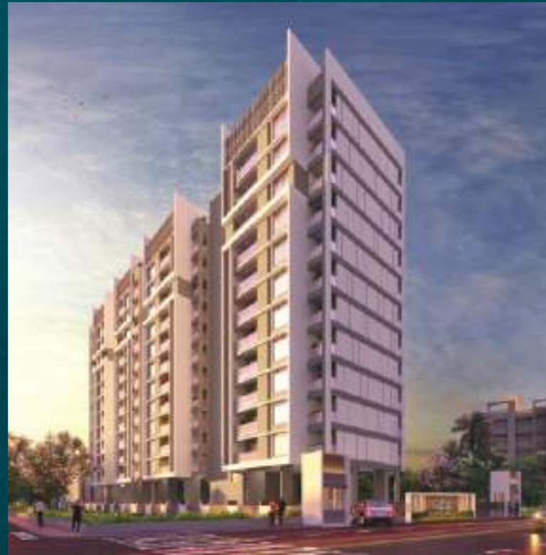
AR Atlas, Wakad