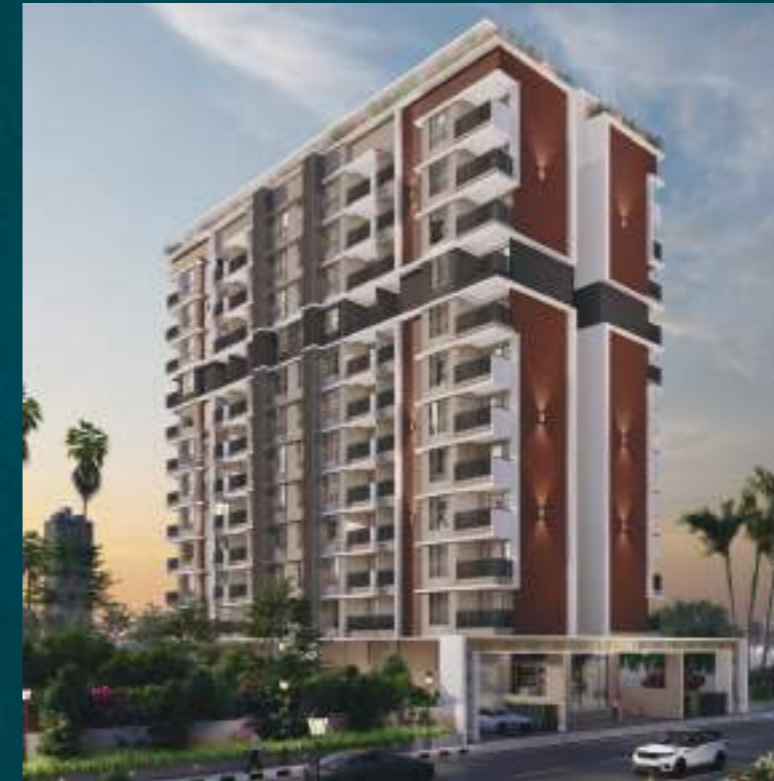
AR Amora, Wakad