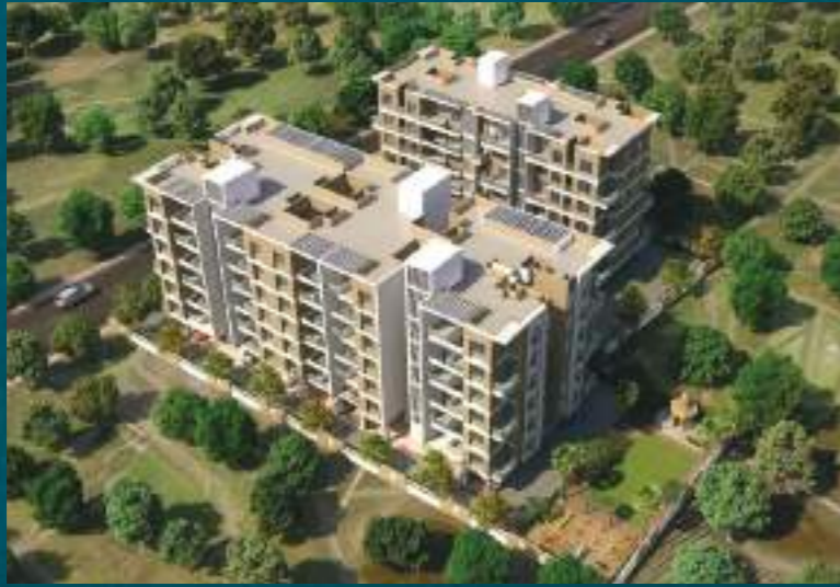
Silver Crest, Wakad