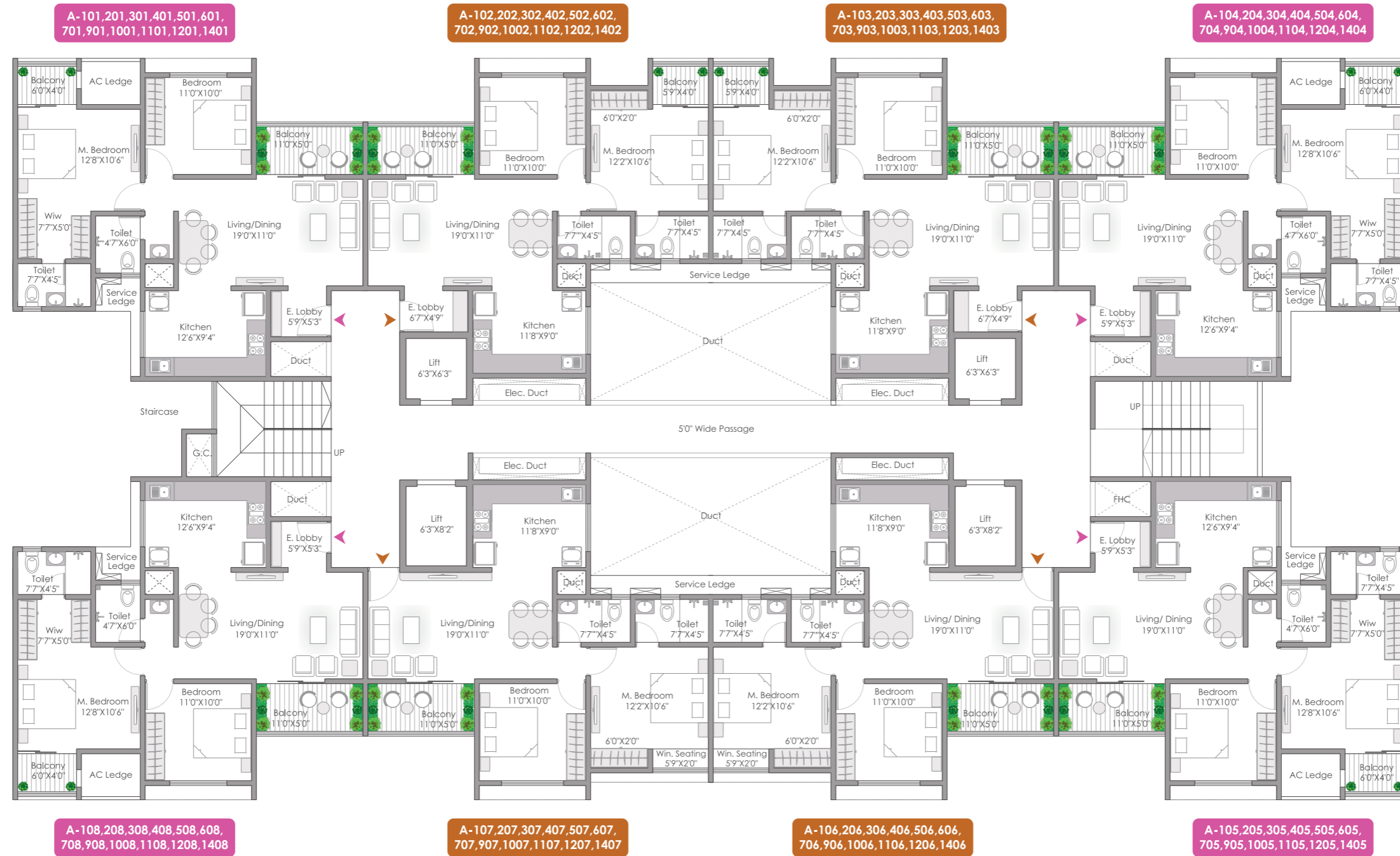
A BUILDING TYPICAL FLOOR PLAN