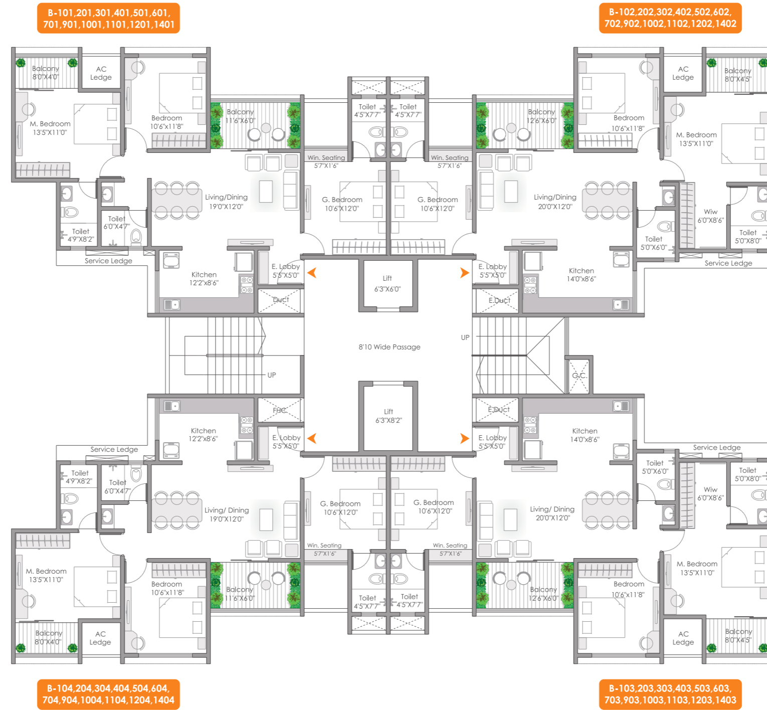
B BUILDING TYPICAL FLOOR PLAN