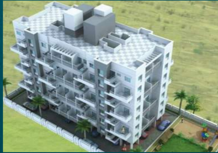
Silver Oak, Rahatani